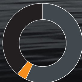
ADJUSTED EBITDA IN 2012 BY BUSINESS (3)